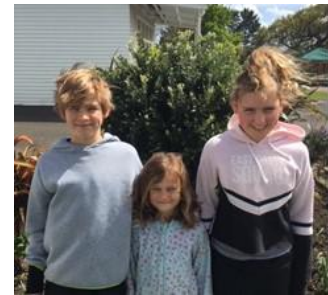
ABSENT FROM PHOTO IZZY